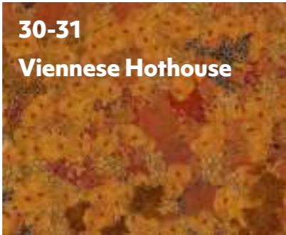
30-31 Viennese Hothouse