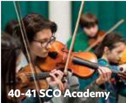
40-41 SCO Academy