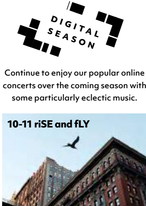
10-11 riSE and fLY