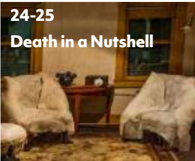
24-25 Death in a Nutshell