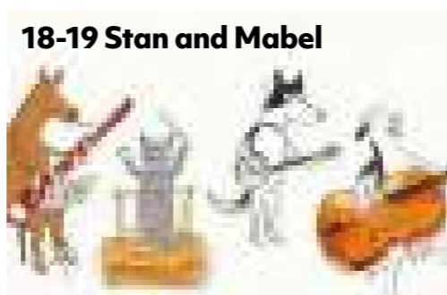
18-19 Stan and Mabel