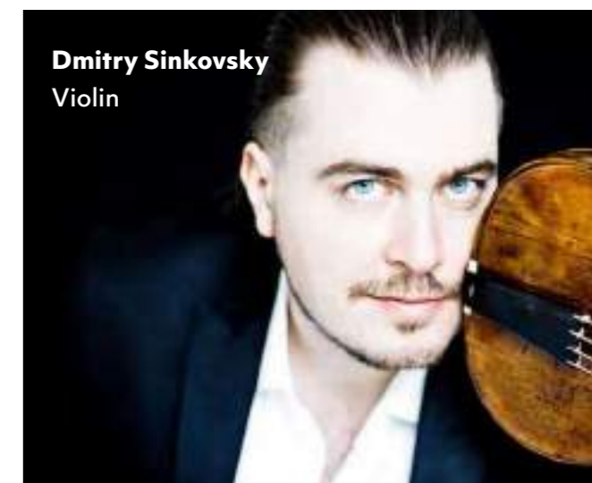
Dmitry Sinkovsky Violin