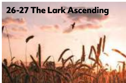
26-27 The Lark Ascending

DIGITAL SEASON Continue to enjoy our popular online concerts over the coming season with some particularly eclectic music.